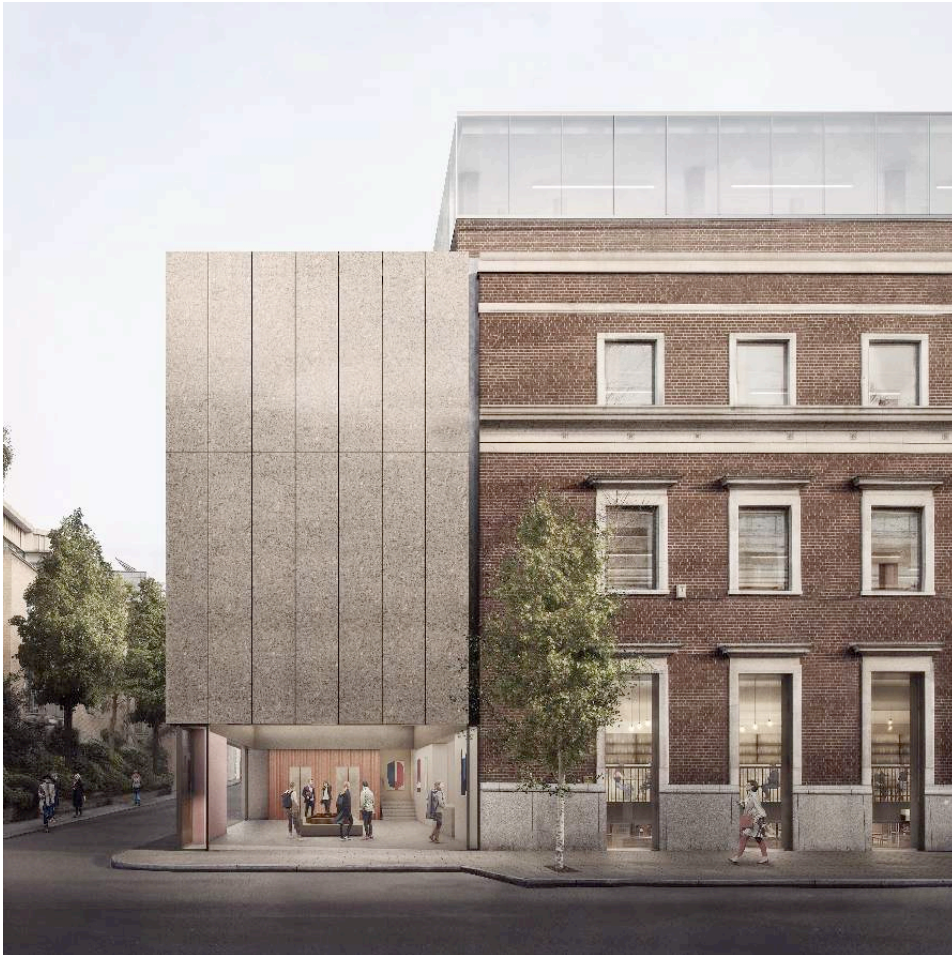
Technique

A former printing press and gin distillery in London's Clerkenwell is to be transformed into a new office hub for the creative industries alongside a floating art gallery and cultural space. Proposals have been submitted for planning by developer General Projects, in partnership with Northern & Midland Holdings, a family owned investment company, who acquired the buildings, known as Laser House, in 1991.